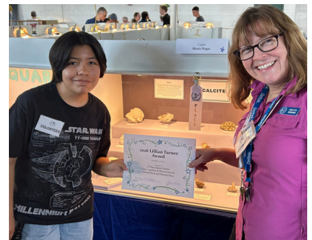
The 1st 2nd and 3rd place winners of the Turner-Mohr awards. A lot of time and effort went into all the FRA exhibits.